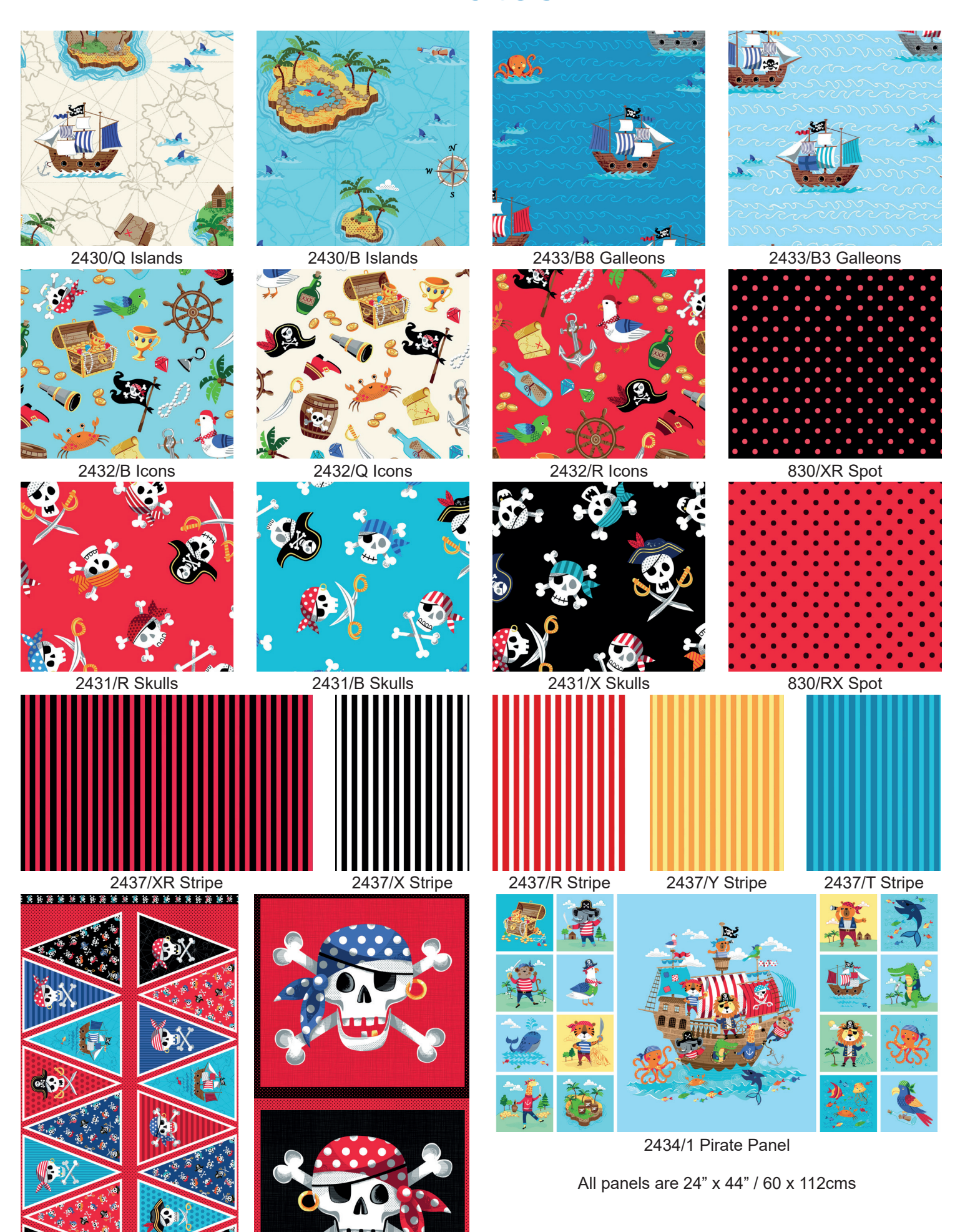
Images for reference only, not correct for actual colour or scale (approx 50%). For further info visit makoweruk.com